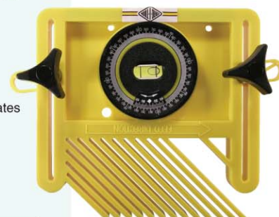
PART No. FAM-1

Can be used to control passage of timber horizontally on router tables or vertically on the fence as a hold down. Spirit level indicates exact angle of timber passage.