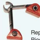
Replacement Corner Pieces Pk 4 (TVCP)