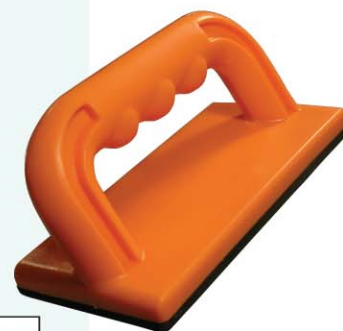
OFFSET This block has an angled contoured handle for maximum grip and operator safety