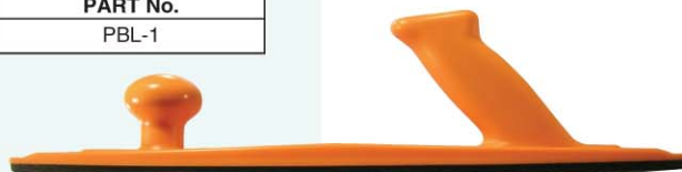
PART No. PBL-1

Made of durable, strong shatter proof plastic with a heavy duty rubber foam pad that will not mark the workpiece.