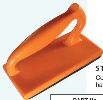
STRAIGHT Comfortable straight handle