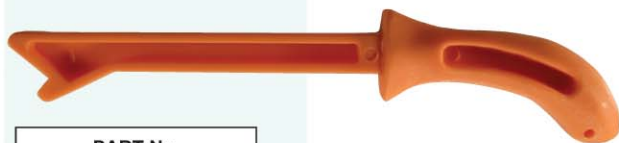
PART No. PS-1